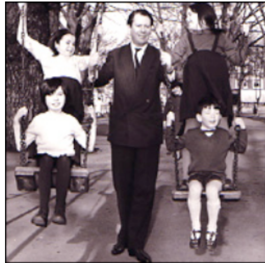
Sir Anthony Berry with his children