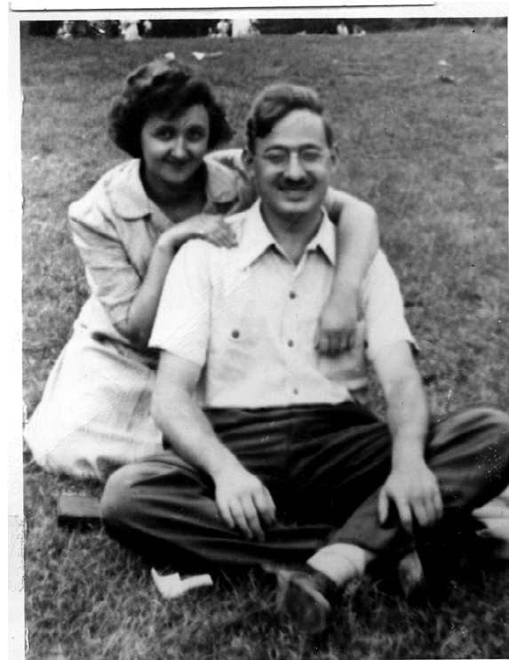
Ethel and Julius Rosenberg, circa 1942